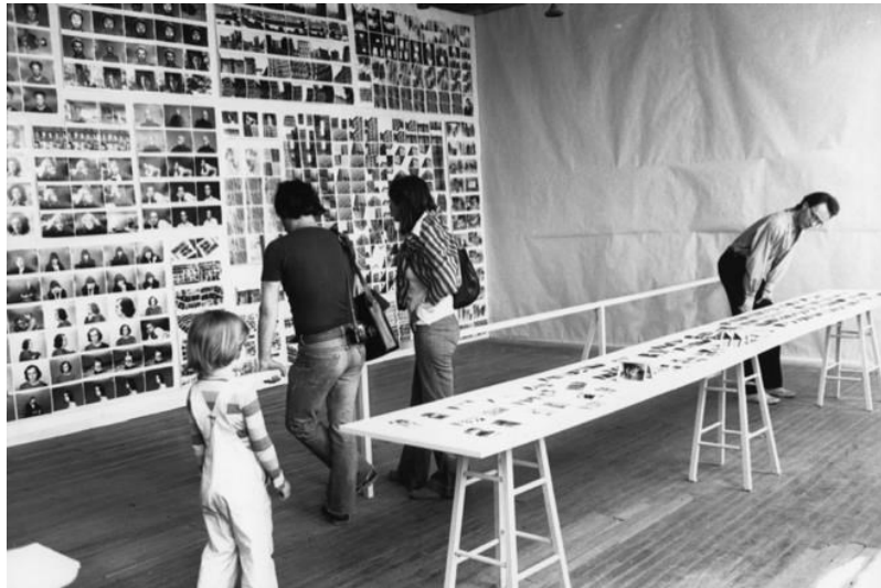
Babette Mangolte, Babette Mangolte: A Photo Installation, "How to Look...", exhibition view with public at P.S. One, Old Wing, Room 204, Long Island, New York, May 11-28, 1978, Photo Copyright © 1978 Babette Mangolte