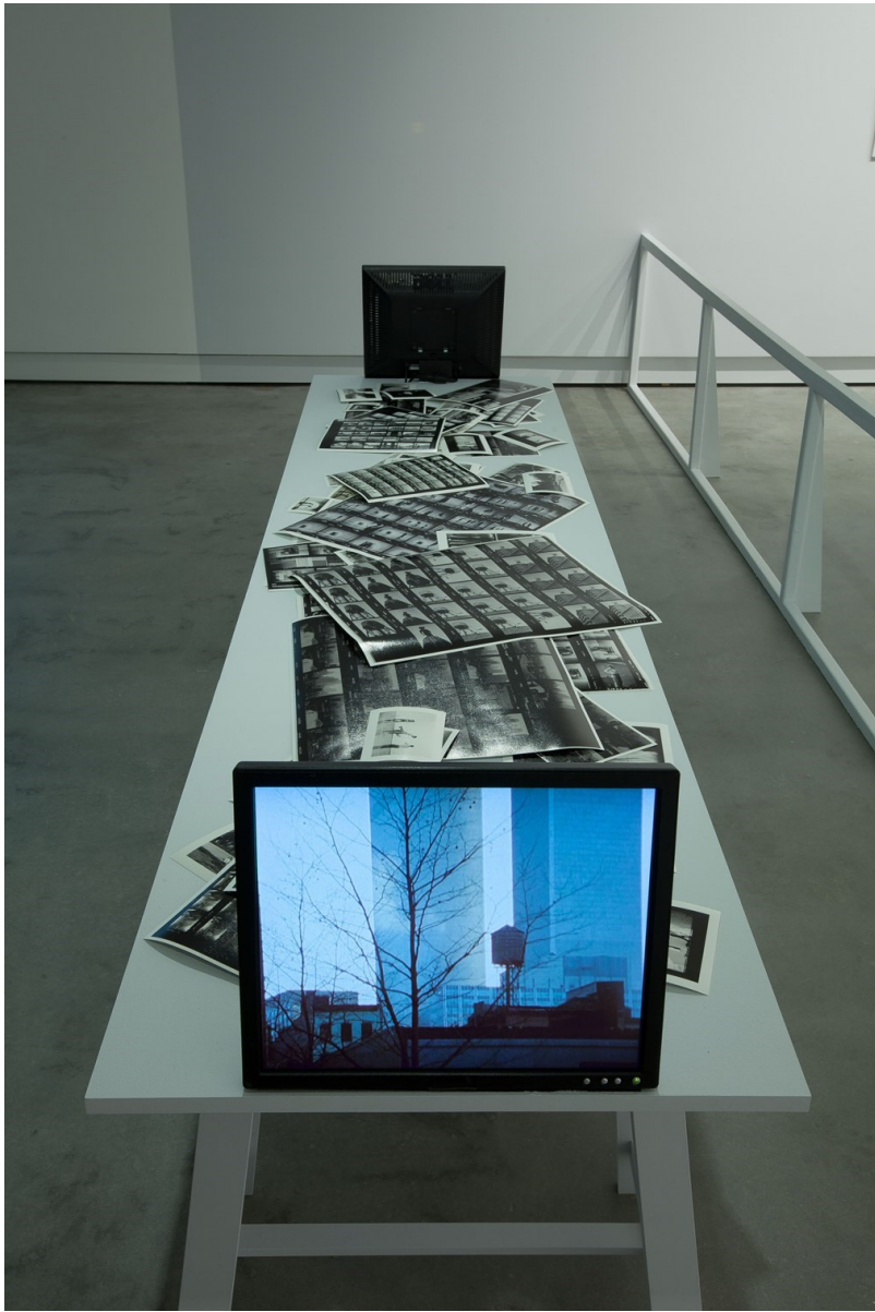
Babette Mangolte, Looking and Touching (2007), installation view at VOX