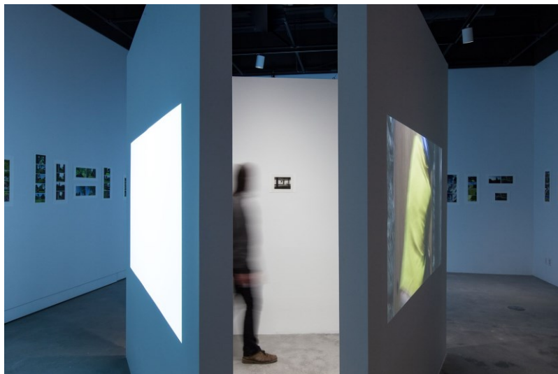
Babette Mangolte, Eloge du Vert, 2012, VOX, Photo Copyright © VOX et Michel Brunelle

Exhibiting Mangolte's work inevitably addresses the historization of performance art, which, while firmly guarding its claim of a supposedly 'dematerialized' art, has become an increasingly image and object-based practice. This paradoxical yet correlative relationship between the live and the mediated, is at the heart of the overlapping revival and discovery of Mangolte's work and has sparked a critical analysis of the status of the artist's intention and the authorial claim of the witness to be brought into play. [13] Mangolte's current art practice is based on her pioneering anticipation, in the early 1970s, to recognize and understand performance art as both an authentic "live-event" as well as a careful concept-based time- and site-specific practice. Mangolte developed an interest in how the avant-garde practices of her peers could be sustained in the future. She was never the author of the works she