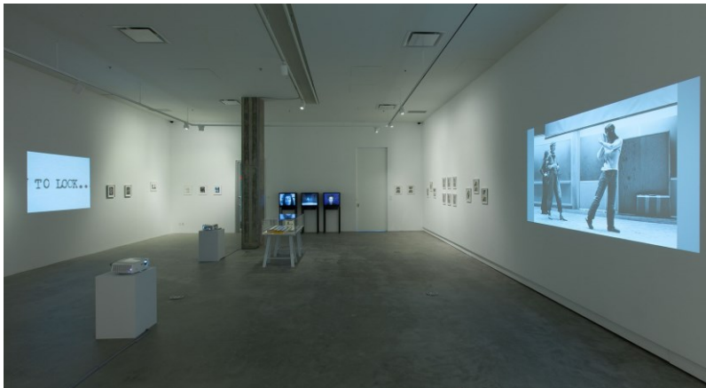
BABETTE MANGOLTE: An Exhibition and A Film Retrospective, installation views, VOX centre de l'image contemporaine, Montréal, January 24 - April 20, 2013

Given this renewed interest in Mangolte's artistic network of the past as well as in her own practice, the question how her art installations touch upon the contemporary became the outset of the curatorial concept. This implied less comparing Mangolte's capacity to articulate and differentiate performative practices, whether dance, theater or visual arts, in her past documentary practice, but rather, three decades later, to look at a growing body of site specifically adaptable multi-media installations. Through a series of six inter-correlating installations, "Looking and Touching" (2007-2012), "Slide Show" (2010), "Rushes Revisited" (2012), "Composite Buildings" (2010), "Eloge du Vert" (2013), as well as a video triptych consisting of "Water Motor" (1978) and two video portraits of Richard Serra and Yvonne Rainer both from 1973 and 1974, the exhibition investigated Mangolte's intellectual fascination with the time- and site-specificity of performative practices in dance, theater, visual arts, and cinema. The curatorial difficulty of presenting a series of Mangolte's hermetic installations next to each other, without falling prey to repetition or chronological fatigue, meant allowing each segment to