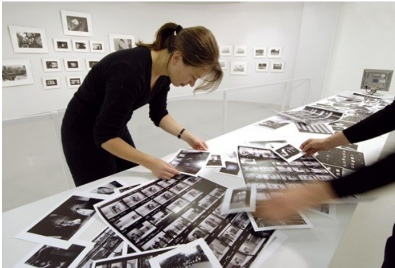
Babette Mangolte, Looking and Touching, 2007, installation view at the Hansard Gallery Southampton, Photo Copyright © 2007 Hansard Gallery Southampton

An interest that also echoed her own explorations of ‘how we look’ at art, as a topic, from own films of the 1970s, one that she was now able to address in her artistic practice. In installations such “Looking and Touching” 2007 or “Rushes” 2008 the stagings of her archive become a key part of her artistic production and reflection on the work processes themselves. Almost exclusively showing in large-scale group exhibitions [17] , Mangolte systematically uses the format of the exhibition as a situational structure, a time-space in which she can address how we perceive and therefore experience knowledge as an integral part of an aesthetic experience.