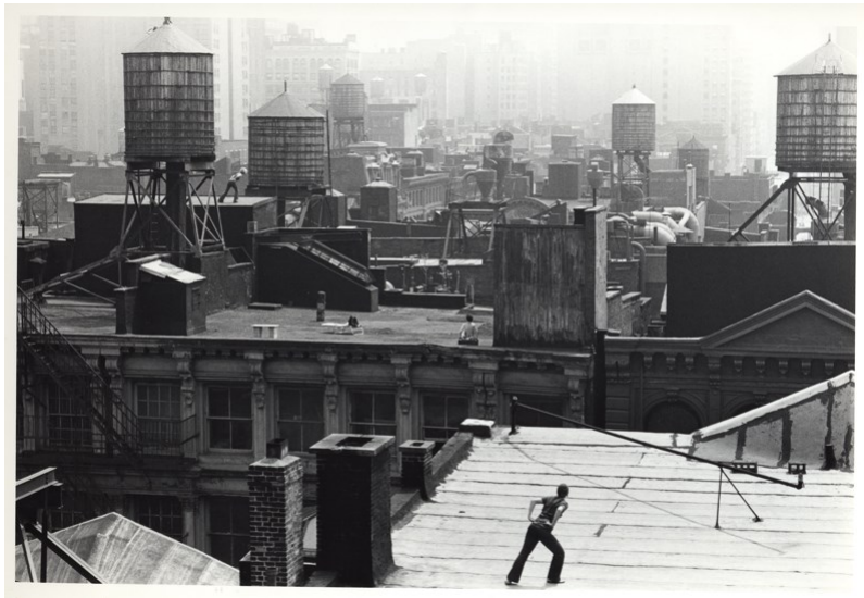
Babette Mangolte, Trisha Brown's Choreography Roof Piece, 1973, Photo Copyright © Babette Mangolte