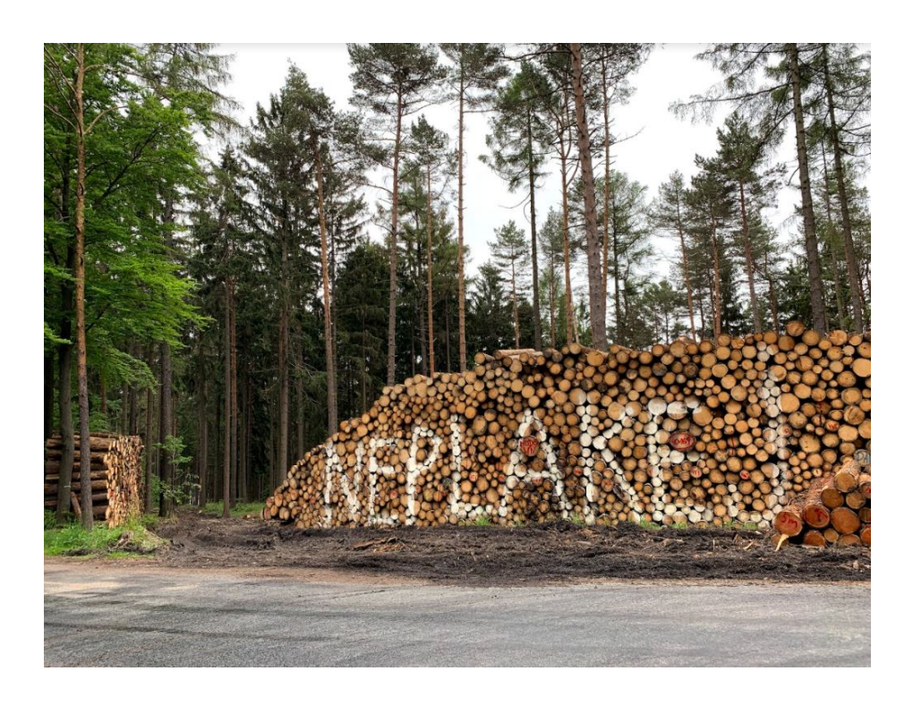
Picture 2. Johana Merta, documentation of the project "Don't be afraid and don't cry", author's archive, 2020, photo Eva Rybářová