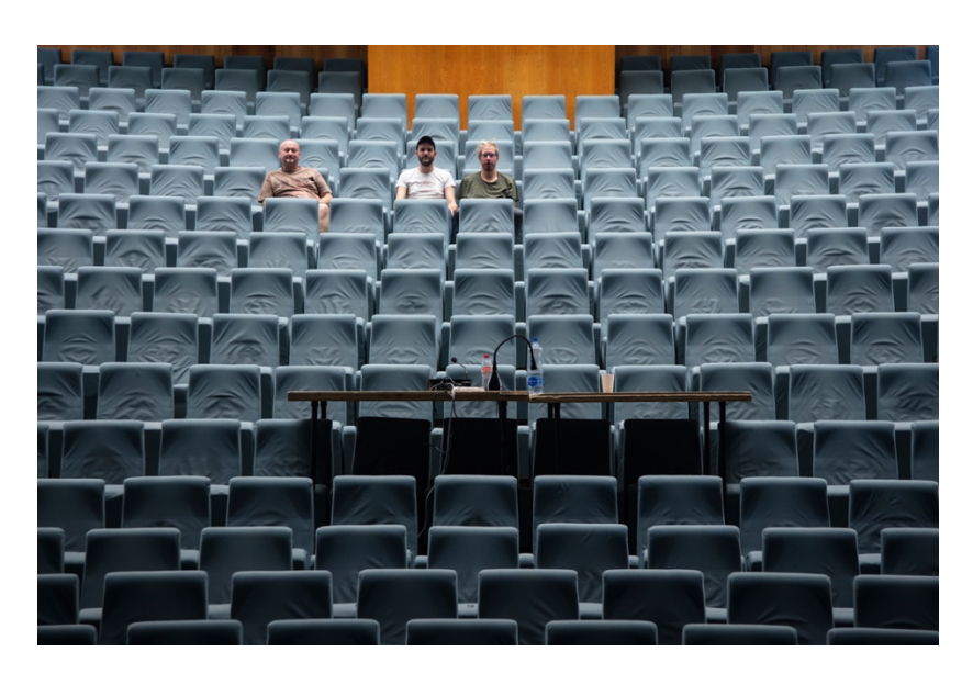
Picture 1. Ladislav Mirvald, documentation of the project "Silences", author's archive, 2020, photo Eva Rybářová

which he made in concert halls and music clubs which had suddenly sunk into post-apocalyptic silence have a similar effect.